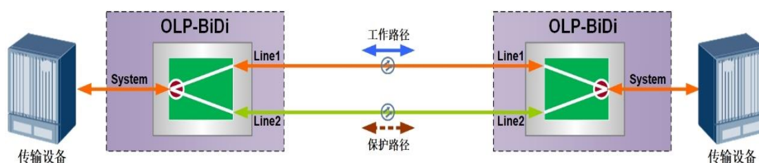
Figure 2.3.2-2 OLPA-BiDi function structure